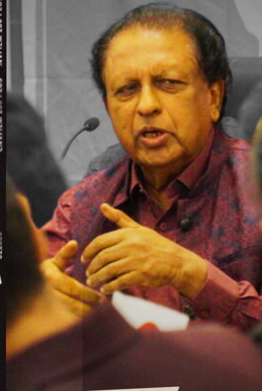
#mun2025 T P SRINIVASAN FORMER INDIAN DIPLOMAT